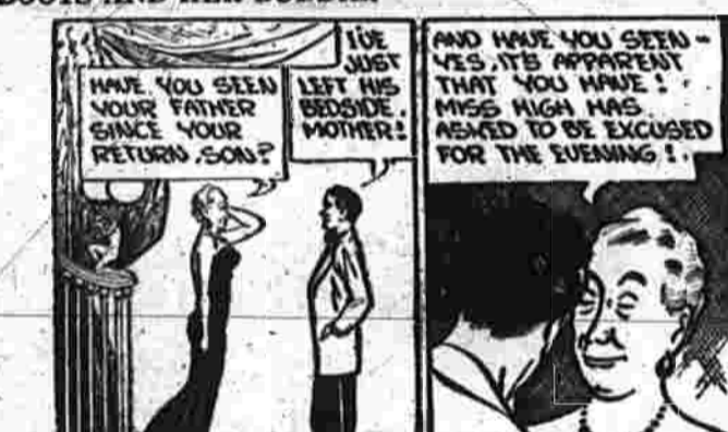
BOOTS AND HER BUDDIE